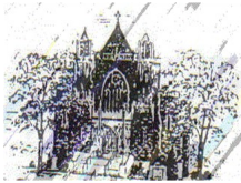
The Little Church