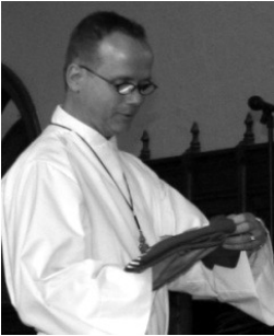
From Our Pastor